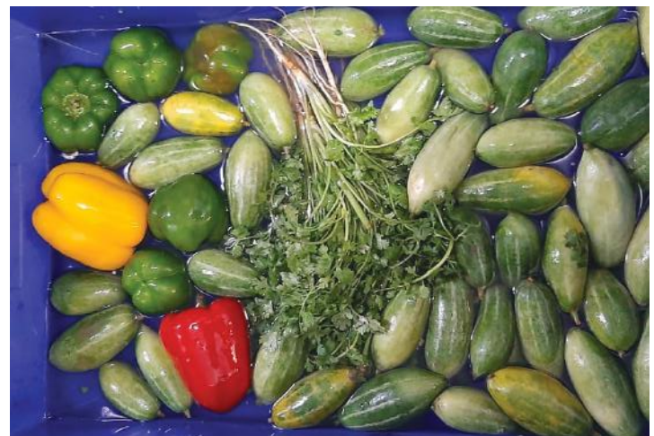
Vegetables are thoroughly cleaned at The Conclave kitchen