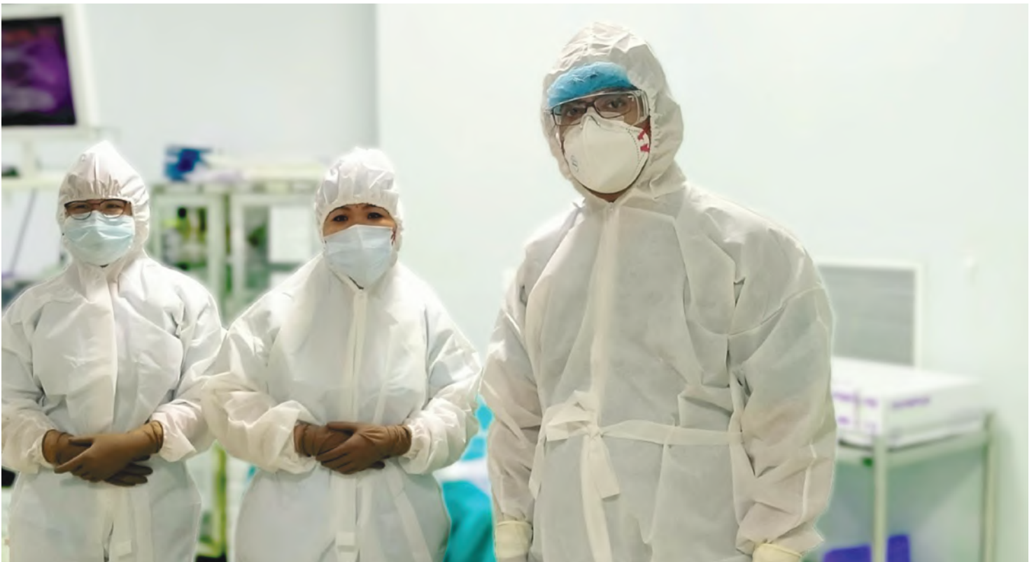
Surgeons, nurses and clinical associates wearing PPE in the OT at Neotia Getwel Healthcare Centre, Siliguri