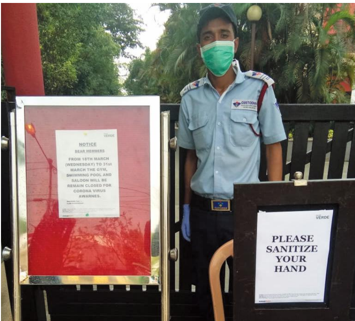
Maintenance staff are provided with mask and hand gloves