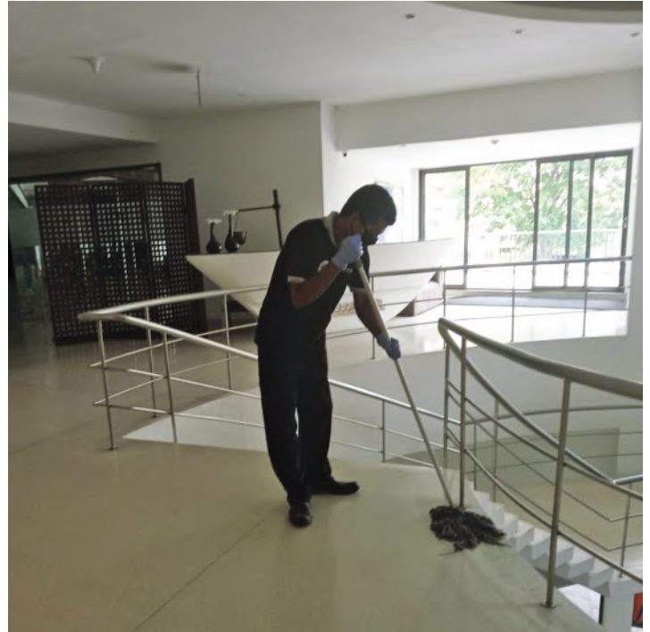
Club Verde is making an all-out effort to keep its premises spotless