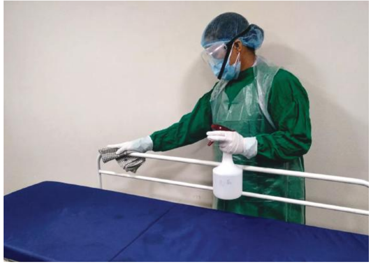
Disinfecting stretchers at NGHC, Siliguri