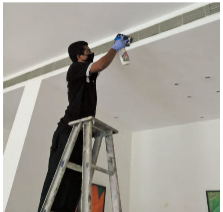
AC Grills being cleaned and sanitised on an on-going basis