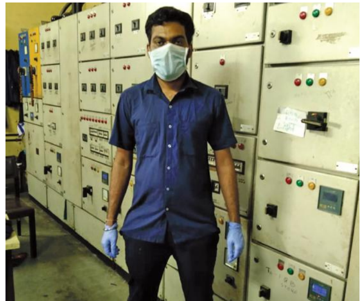
Maintenance staff are geared to tackle the virus