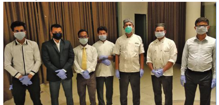
F&B service and production staff with masks and gloves