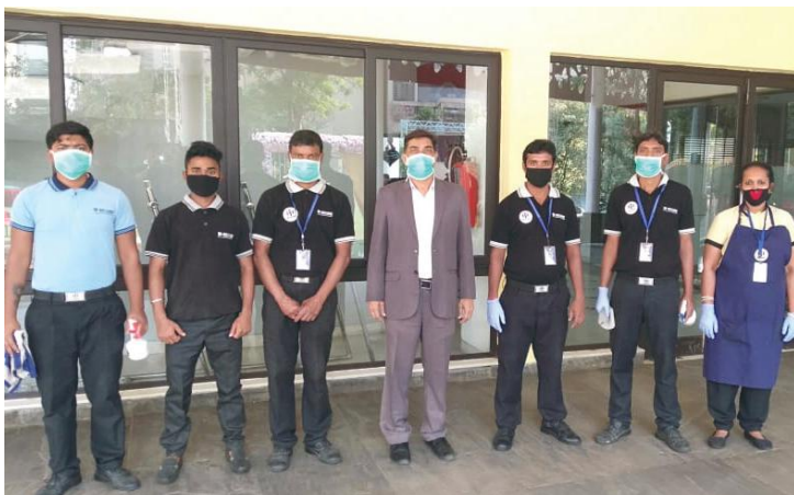
Housekeeping staff at Club Verde