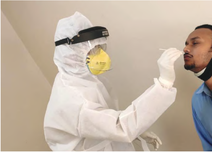
Phlebotomist wearing PPE during swab collection at NGHC, Siliguri