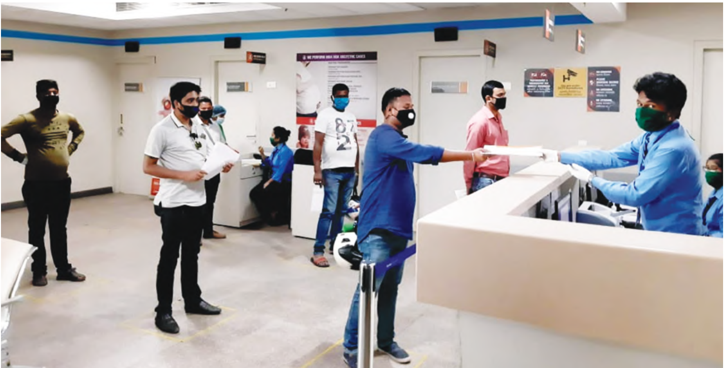
Social distancing is strictly followed during patients' registration at NGHC, Siliguri