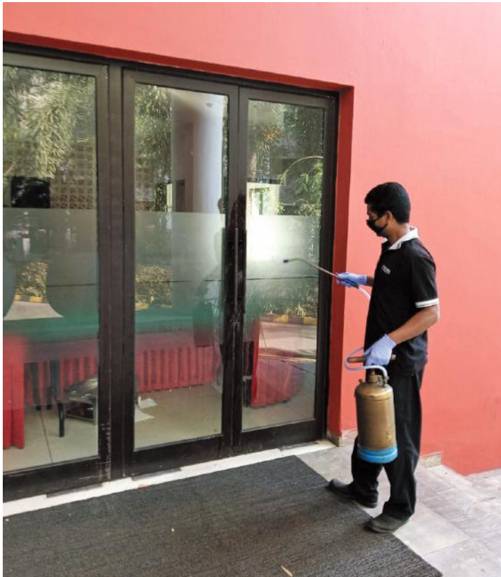
All doors and handles are sanitized on a regular basis by inhouse staff