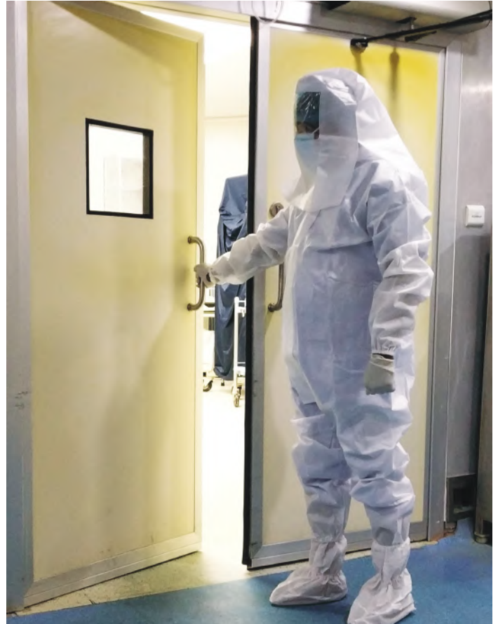
Doctors in PPE suits at Bhagirathi Neotia Woman & Child Care Centre, Rawdon Street