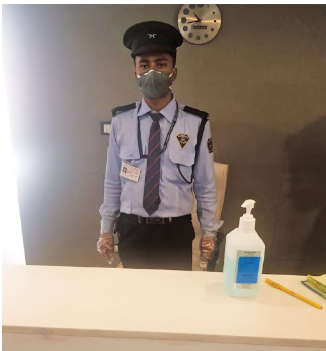
Hand sanitizers are available with security staff at entry points