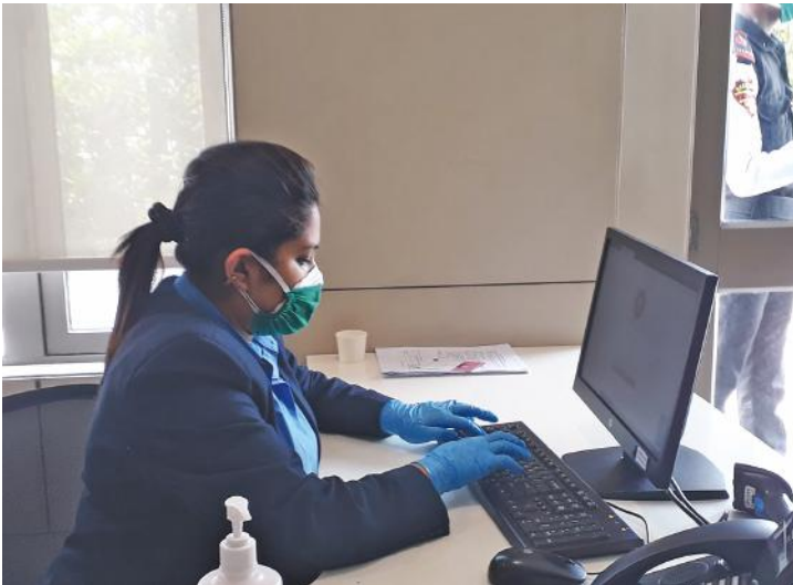
Protective gear worn by hospital staff at BNWCCC, New Town