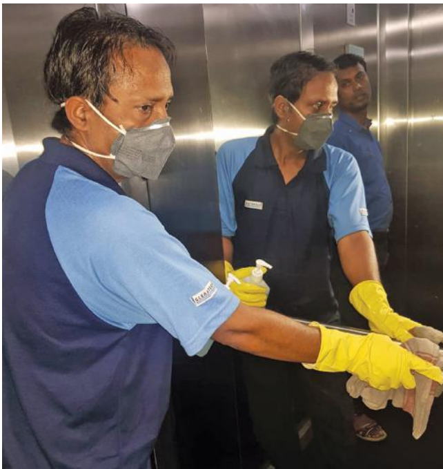
Cleaning lifts on a regular basis to counter any infection

B usinesses and employers must play a significant role if we are to stop the spread of COVID-19. To stay safe and protected several hygienic measures are being taken across our commercial properties. Regular cleaning with disinfectants across all corners and frequent touch points like railings, handles and lift buttons are being strictly carried out along with fumigation every evening. Also, face masks are obligatory and not a replacement for established preventive practices, such as physical distancing, cough and sneeze etiquette, hand hygiene and avoiding face touching. It is essential that workers use face masks properly so that they are effective and safe. Thus it is compulsory to wear masks and gloves for all security and housekeeping staff. Masks are also a must for all visitors and employees as is sanitization and body screening at all entry points.