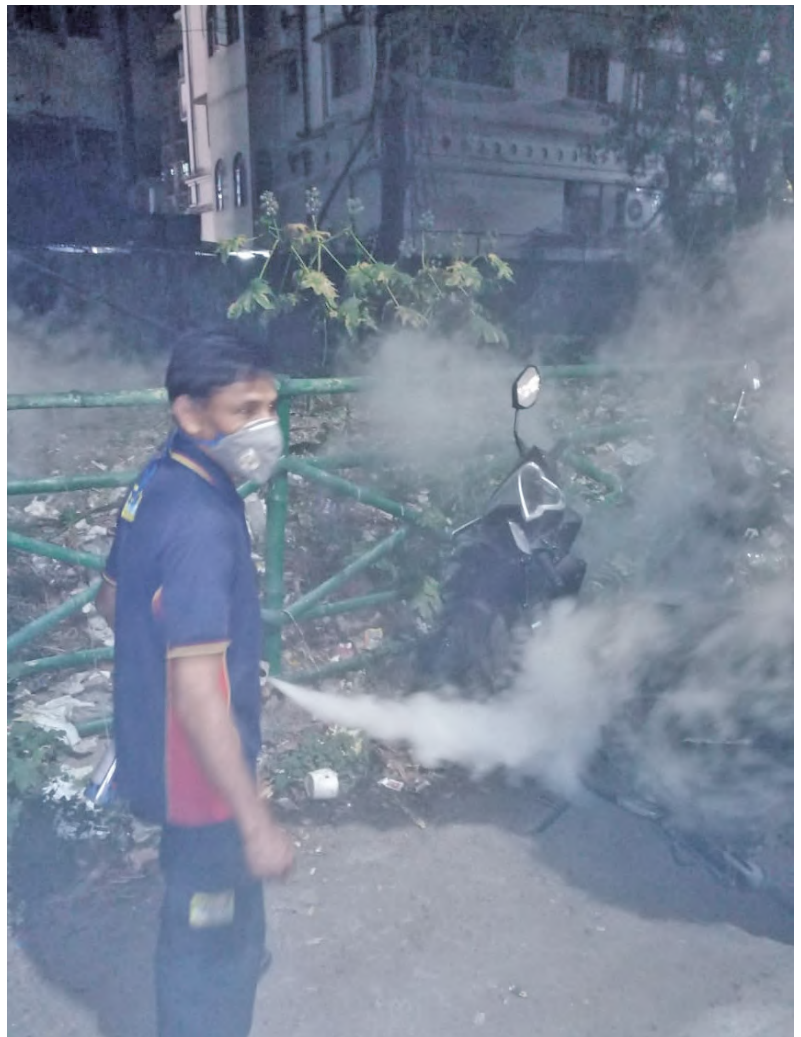
Fumigation for safety on outdoor premises and parking lots