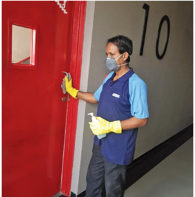
Door handles being made safe with regular cleaning with disinfectants