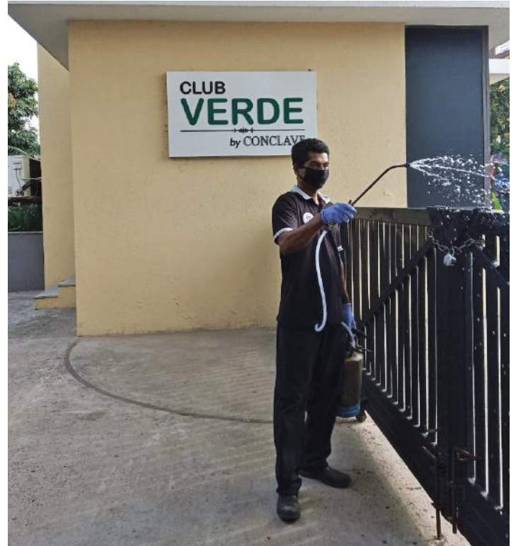
The main gate at Club Verde is sanitised every day

Cleanliness is next to godliness and in these difficult times this proverb takes on fresh significance at all our clubs. We are in the midst of an unprecedented, worldwide pandemic, but it helps to know that we are all in this together. Therefore, we continue to put plans and procedures in place to minimise the impact and be able to continue to provide the highest quality of services you need. As the current scenario evolves and helps us to embrace the new 'normal' lifestyle and resume our daily routine, Ambuja Neotia has taken strict health and hygiene initiatives to keep the experience of customers and stakeholders intact but under proper safety measures. From wearing masks, using temperature guns, donning caps to using sanitized equipment, proper sanitation and fumigation at regular intervals, we have implemented all guidelines to ensure a safe and sound ecosystem around us along with the sacrosanct mantra of 'Social Distancing.' The Group has pledged to be responsible for the well-being and safety of every stakeholder, thus taking detailed care of work process and functioning of all its verticals.