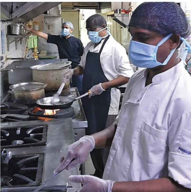
Social distancing is maintained at The Conclave kitchen