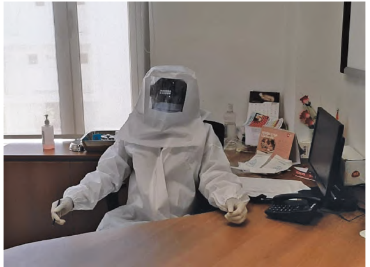
PPE worn by our consultant at the OPD at BNWCCC, New Town