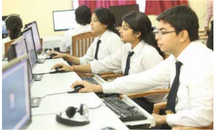
The Neotia University (TNU) has a vision of imparting education that prepares students to be leaders for the emerging global society