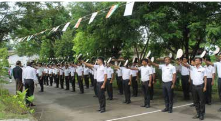
The Neotia University celebrated National Maritime Day at the campus with great pomp and ceremony