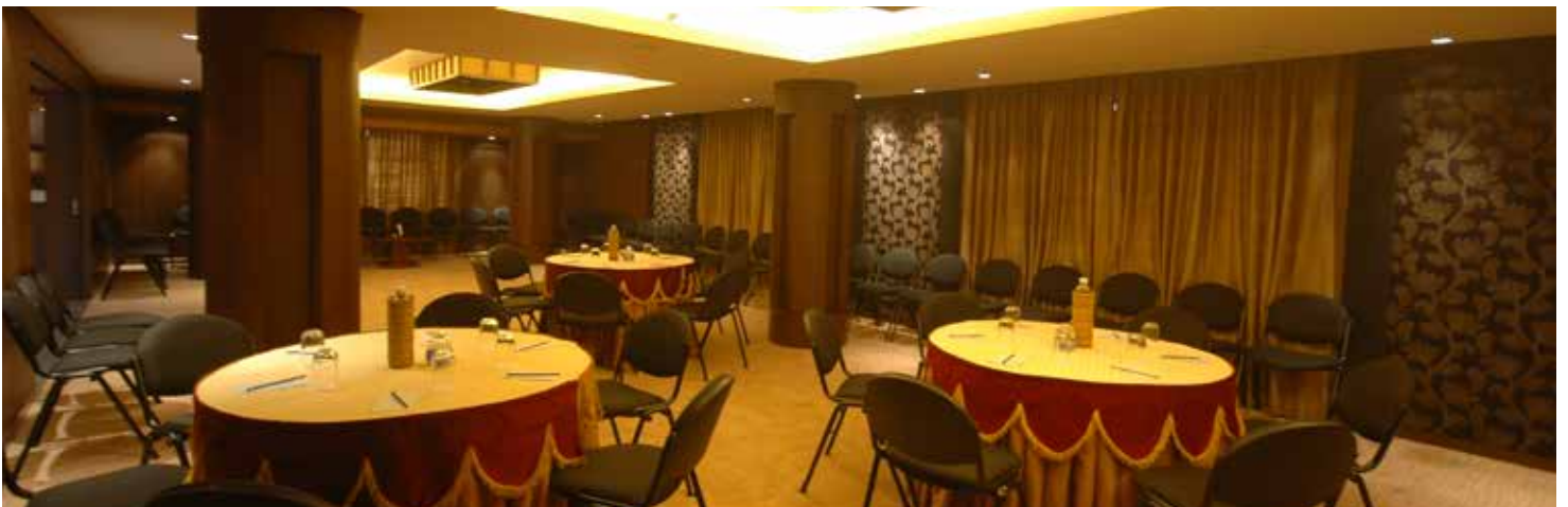
The Conclave's spacious banquet hall for meetings and celebrations