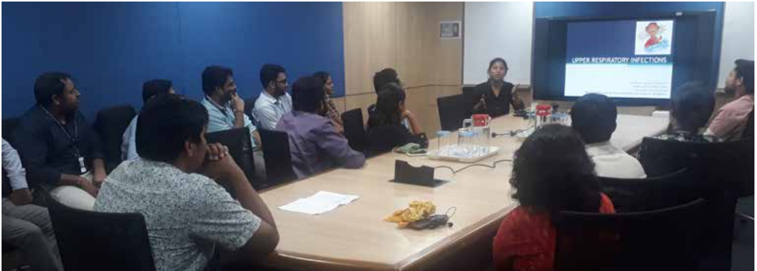
A Health Talk on 'Upper Respiratory Infection' was hosted by Bhagirathi Neotia Woman and Child Care Centre, New Town for the neighbouring employees of TCS, Infospace to elucidate the dangers of lung diseases that can affect the young and the old