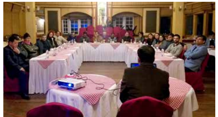
Neotia Getwel Healthcare Centre also organised a seminar at Darjeeling to emphasize on the advancements in the field of Nephrology and Urology