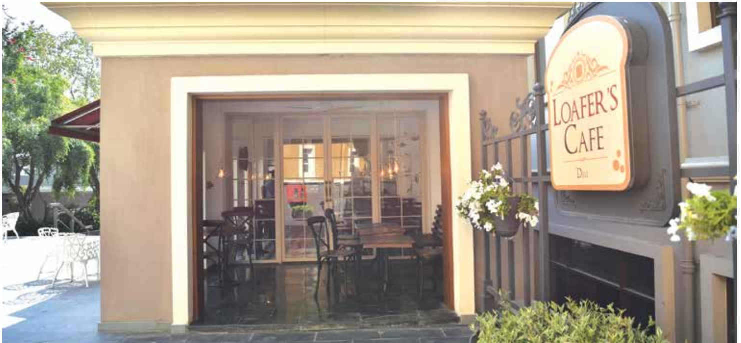
The main entrance to Loafer's Café is reminiscent of similar hangouts in several European countries