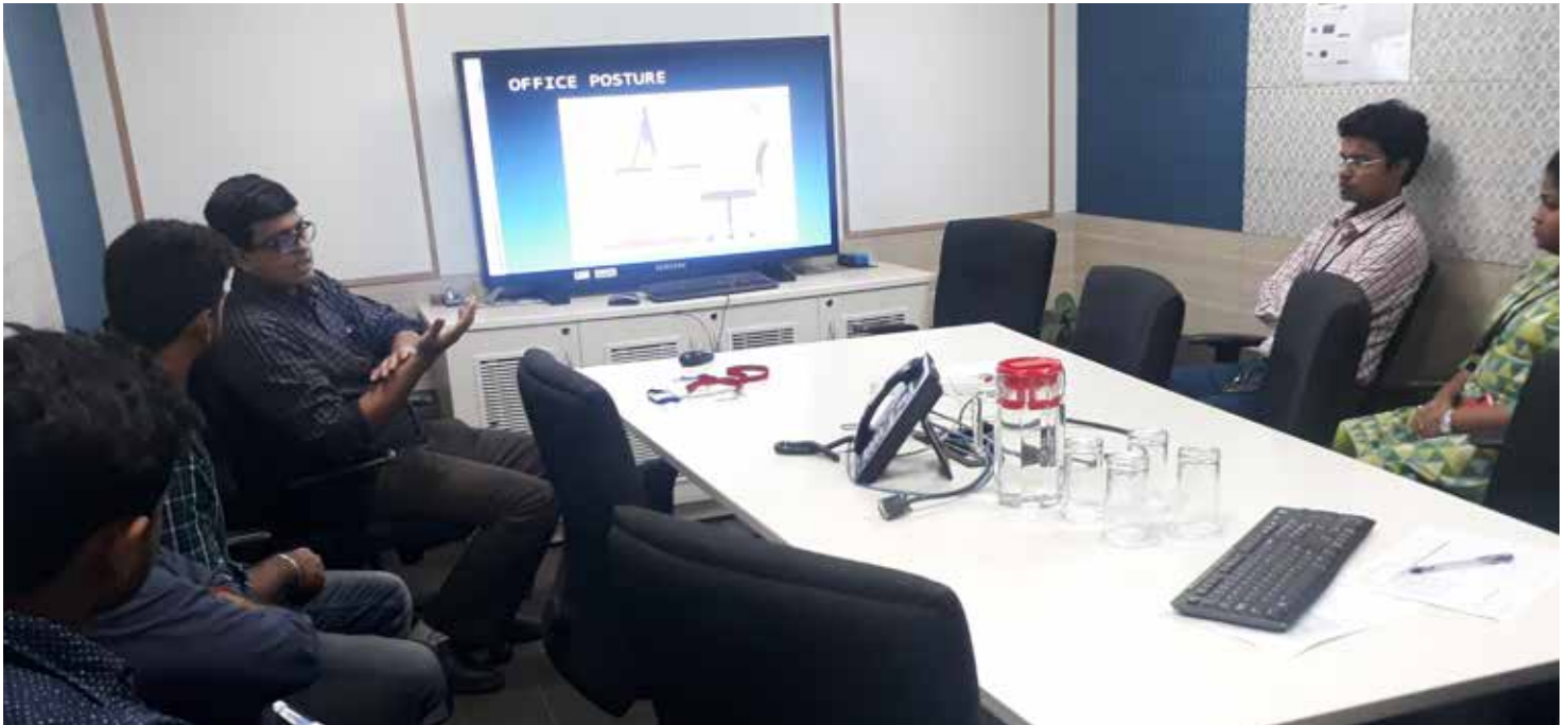
A session on 'Awareness About Back Pain At The Workplace' was organised recently at Bhagirathi Neotia Woman and Child Care Centre New Town, for the employees of TCS, Sabina Park, New Town. This meeting was much valued by the participants