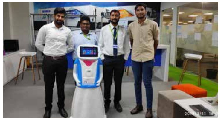
Robotics Engineering students of TNU, along with a faculty member of WABCO Digital Lab, are seen interning at Chennai