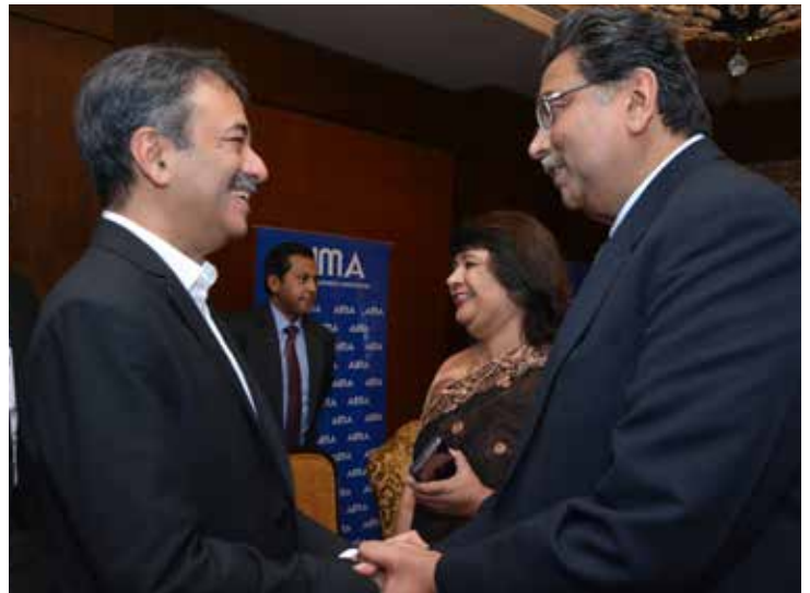
Eminent film director, Rajkumar Hirani, was awarded AIMA's 'Director Of The Year Award 2019' for making a fundamental difference to cinema. Seen here with Harsh Neotia at the Awards Night