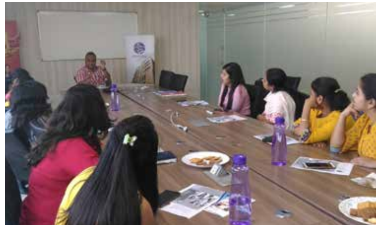
Stress is the body's reaction to any change that requires an adjustment or response. BNWCCC, Rawdon Street organised a much-appreciated awareness session on 'Lifestyle Illnesses & Stress Management' for women employees of Dabur India Ltd