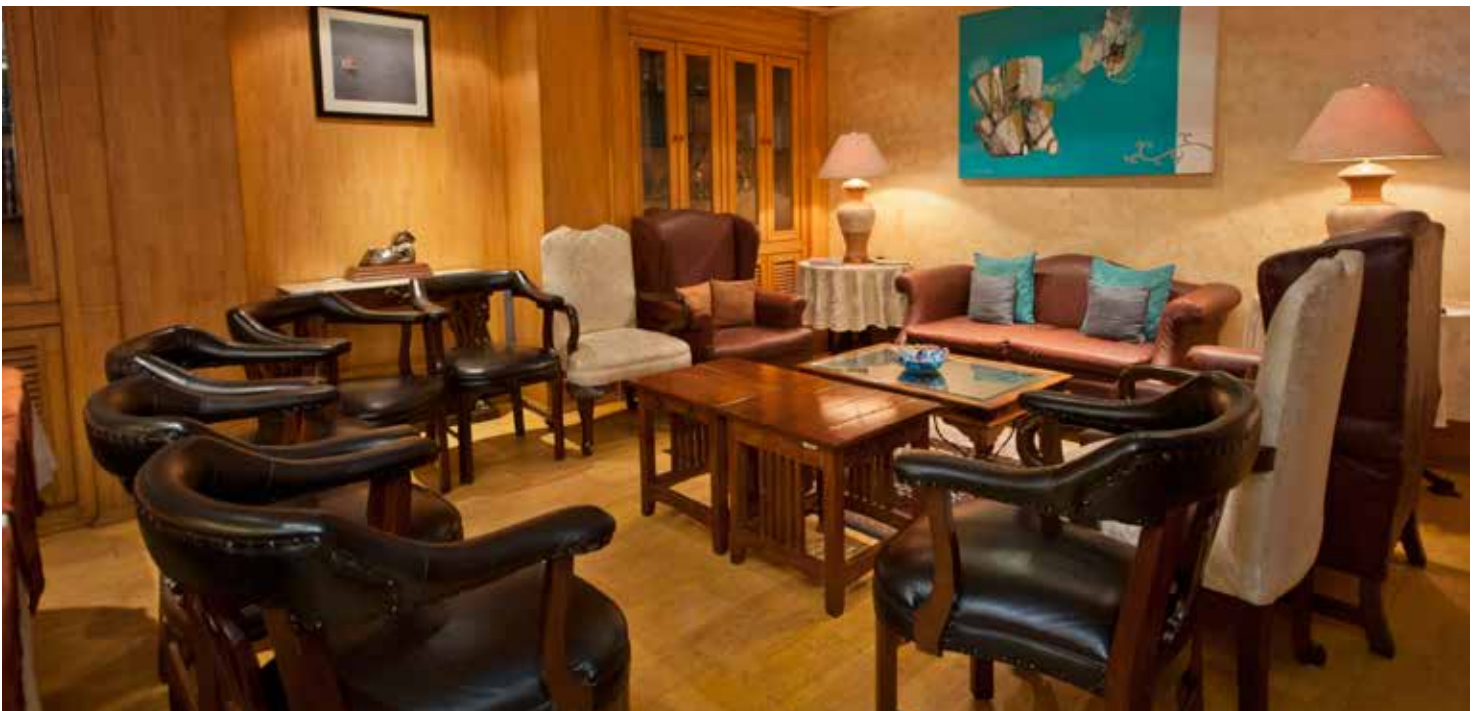
The Quiet Room is ideal for small meetings and quiet repasts