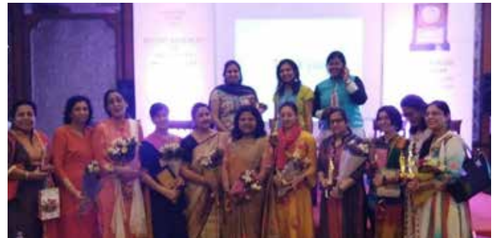
Infertility treatments have improved and options for pregnancy have expanded. A talk on 'Recent Advances in Infertility Management,' was recently organised by Genome Raipur at Hotel Babylon Inn