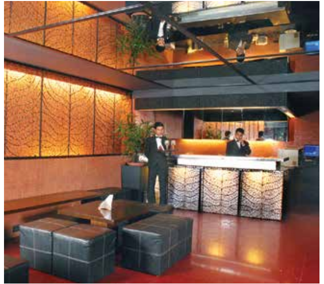
Whatchamacallit, a multifaceted banqueting area