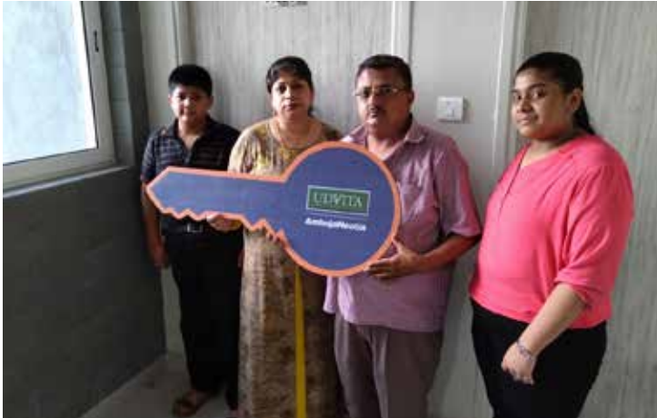
Some happy home owners of Udvita at Manicktala where apartments were recently handed over before the stipulated time of completion