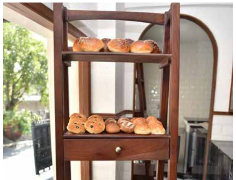
Loafer's Café is an ideal venue for morning Elevenses, coffee meets and afternoon tea accompanied by delectable breads and small eats