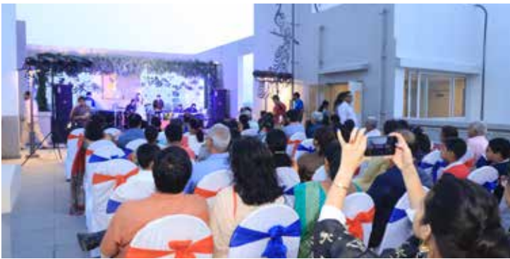
An evening of celebrations with the new home owners at Udvita, which was followed by musical performances and High Tea for the guests