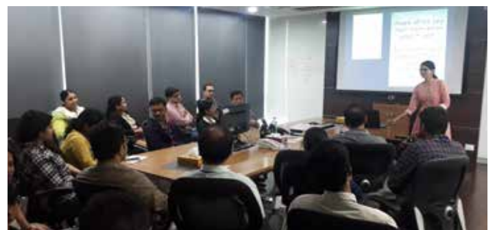
BNWCCC, New Town also arranged a very enlightened corporate health talk on 'Awareness About Ovarian & Uterine Cancer' at NIIT, Ecospace, Kolkata for a keen and enthusiastic audience