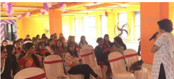
A corporate session on 'Awareness About Cervical Cancer' for the women associates of Arohan Financial Services Limited, Sector V, Kolkata was recently organised by BNWCCC, New Town