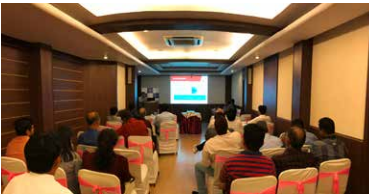
To spread awareness about liver related disorders, Neotia Getwel Healthcare Centre structured a seminar on the occasion of 'World Liver Day' at Siliguri that was highly applauded by the participants