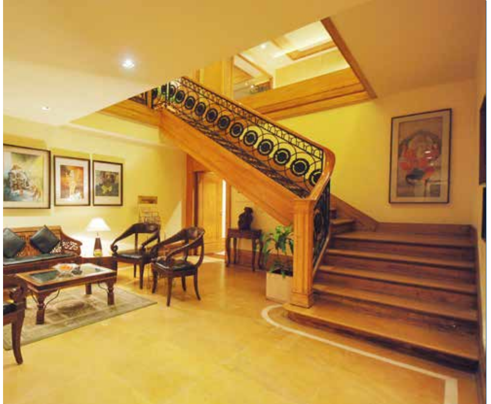
The intimate reception area at The Conclave, leading to the first floor of the club