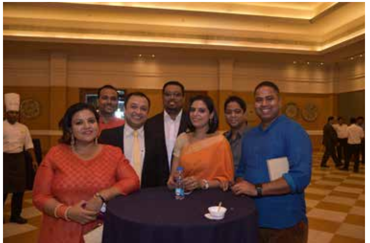
Ambuja Neotia Group's hospitality division, Choicest Enterprises Ltd, recently celebrated 36 glorious years with a lively musical performance, a play and an innovative fashion show by enthusiastic members of the company