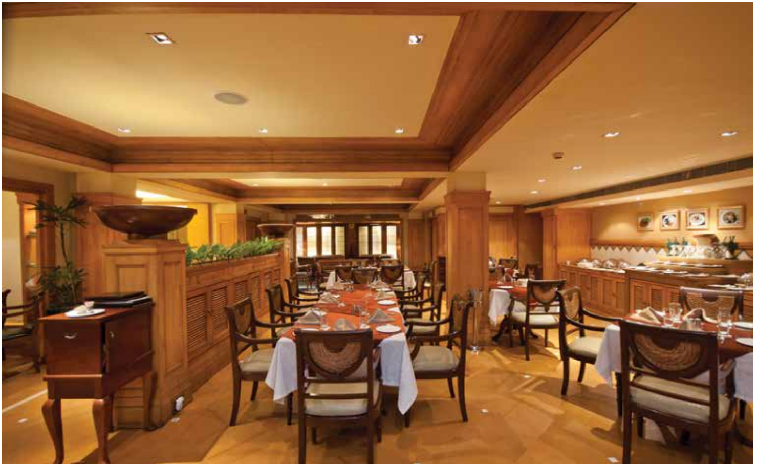
The main dining area at the club exudes an atmosphere of sophistication for its members and their guests