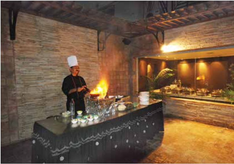
The al fresco rooftop party area, ideal for cocktail parties and dinners