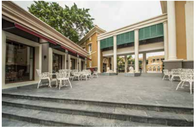
The Loafer's Café at Swabhumi is situated outside the main entrance of Raajkutir for informal meetings and hassle-free addas

Cafés, coffee shops and tea rooms have always had a special place in Kolkata. The most traditional, perhaps, is the Indian Coffee House on College Street that has over time seen the likes of writers, poets, artists, actors and revolutionaries take a proverbial sip from the fabled cup! Throughout history, people have spent time in cafés all over the world in lively discussions, from the ones that first originated in the Middle East way back in the 16th century to those that have made the sidewalks of many European cities famous. The cafés in Paris certainly form a part of the city's culture and lifestyle, many of them standing for years and adding to the history of the surroundings and telling stories with every cappuccino served. The Loafer's Café is an exciting new addition to Raajkutir's repertoire in Kolkata. Located in Swabhumi, the chefs have handcrafted exclusive creations of a typical Victorian high tea that celebrates cakes and pastries, cookies and brownies, sandwiches and croissants and other small eats. Over a hot latté or plain black coffee, Loafer's Café has the right atmosphere for an intimate rendezvous or a lively 'adda' session with friends. The possibilities of meetings here are endless, depending on your mood and inclination!