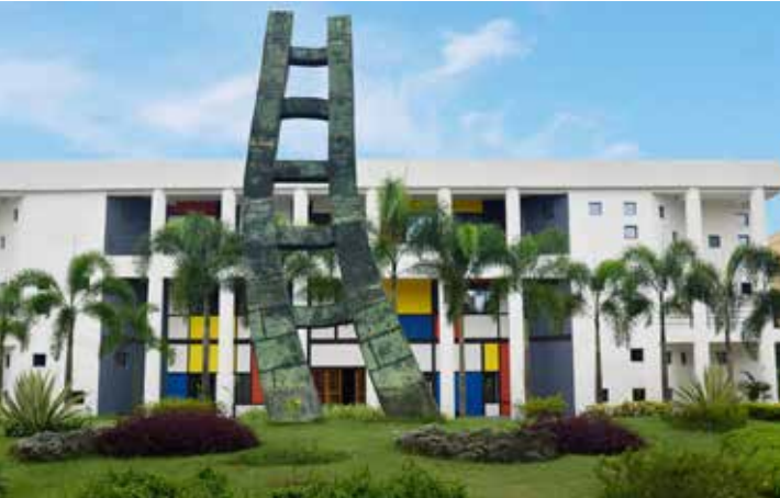
An abstract sculpture at the entrance of the University premises that represents unlimited possibilities to reacher greater heights