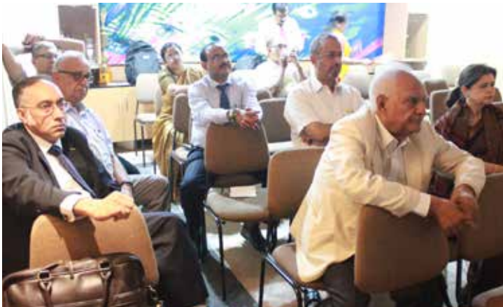
A medical seminar on Endometriosis was recently arranged at BNWCCC Rawdon Street. Endometriosis occurs when the tissue that makes up the uterine lining is also present on other organs. It is usually found in the lower abdomen but can appear anywhere in the body