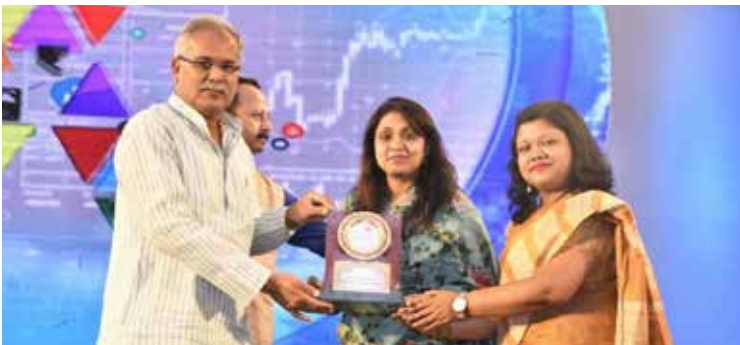
IVF is a widely known type of assisted reproductive technology. Genome Raipur was felicitated with the 'Most Trusted IVF Centre In Chhattisgarh' Award at News 18 Network's Business Excellence Awards event