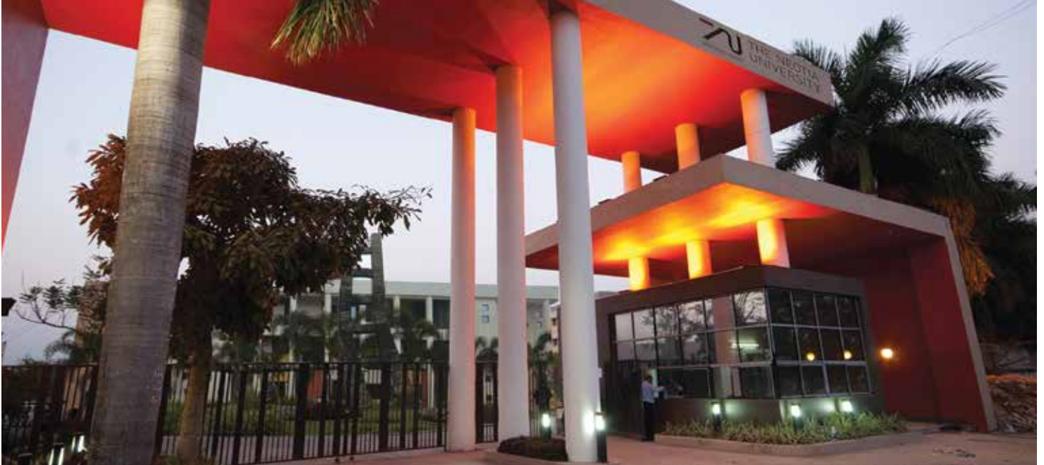
The Neotia University (TNU), West Bengal has been recognised and awarded as the 'Symbol of Excellence in Education & Skilling India's Future' by The Economic Times, Best Education Brands 2017