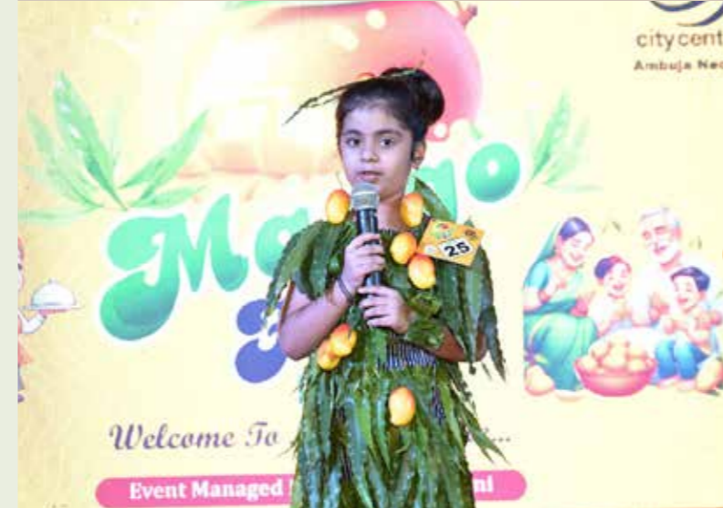
Mango Mania, a flagship event of City Centre Raipur, recently brought together different varieties of mangoes and mango-based products for lovers of the king of summer fruits in Raipur.