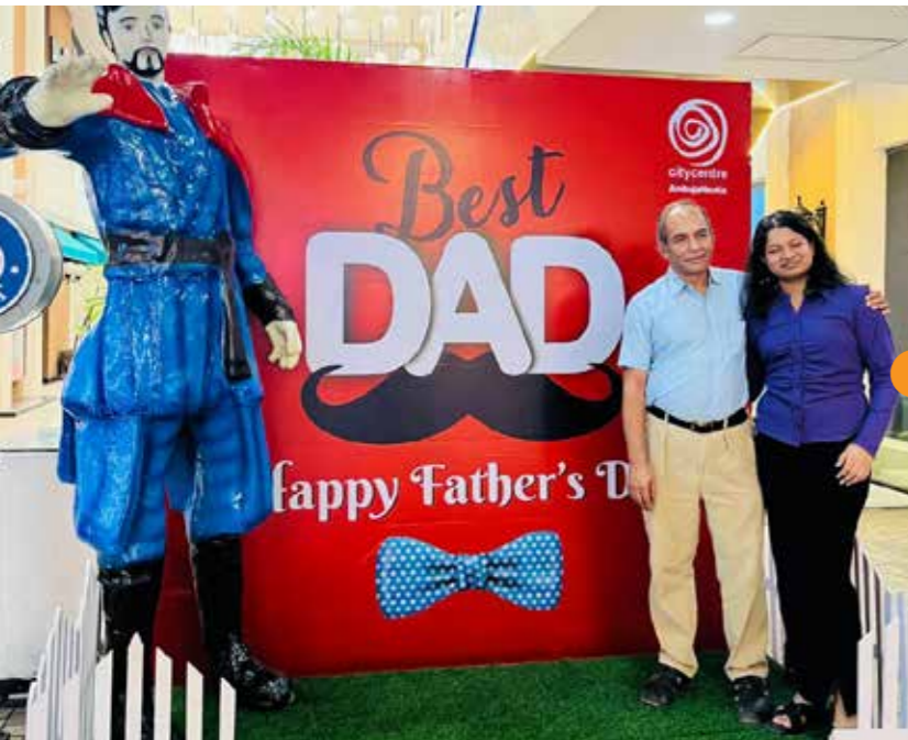
Visitors were delighted to pose with their dads in front of the Best Dad installation on the occasion of Father's Day at City Centre Raipur.