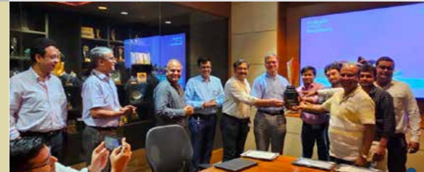
Team Urvisha became the proud winner of the SHE Rolling Trophy for the fourth quarter of 2023-24. This award acknowledges the project with the best safety performance of the quarter.