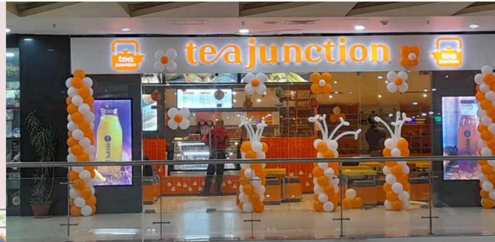
The Tea Junction outlet at Diamond Plaza mall in Nagerbazar has been recently reopened, with a new look. The outlet had been temporarily shut for renovation.