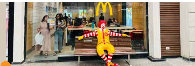
Visitors at City Centre Raipur were in for a pleasant surprise recently as the mall witnessed new store launches. McDonald's introduced Mc Café, an exclusive for the city of Raipur, while Market 99 was opened at the Lower Ground Floor.