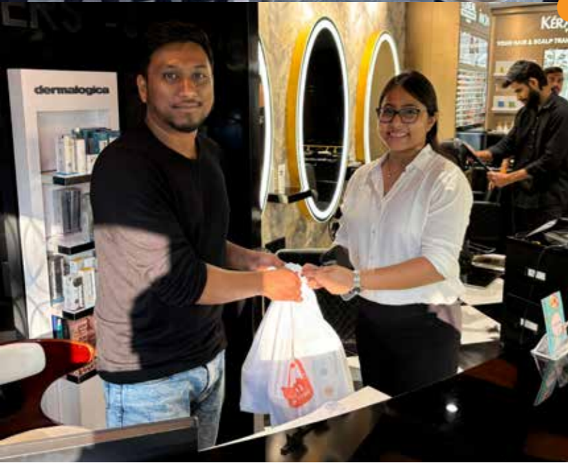
It's time for a gala birthday bash as City Centre Salt Lake turns 20! Two decades of spreading happiness, redefining the experience of a mall in Kolkata and receiving of immense love and support by loyal customers, visitors and retail partners called for a celebration. The 20th anniversary celebrations began with a cake-cutting ceremony followed by fun, games and gifts galore!