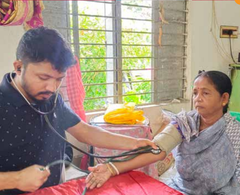
Bhagirathi Neotia Woman and Child Care Centre recently organised a Community Health Programme for the residents of Puna Village in association with Puna Vivekanda Seva Sangha, at their activity centre in Sahararhat near Falta. A Free General Health Check-up was carried out for around 130 beneficiaries as part of the programme. They were provided with free consultations and medicines.