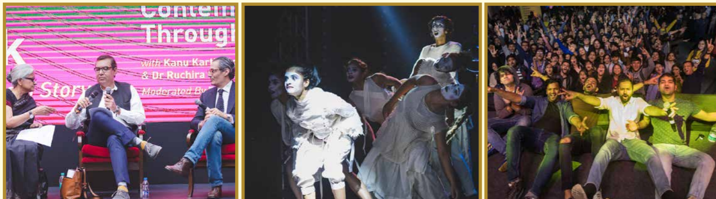
Panel discussions, dance and other performing arts get showcased at TIS

For feedback, I try to listen to what is said and not said. We realised that families wanted to come with their children. Because TIS was a great place to hang around with everybody. But what do the children do? So, we worked with this group called Young Minds, who rolled out fantastic activities for the children. They supervised them, took care of them. It was a safe environment for the kids, where they were having fun their own way. That really worked. So I realised that it's so important to have something for the family. For us, The India Story is a family event. How can you define India without family? It is a collective.