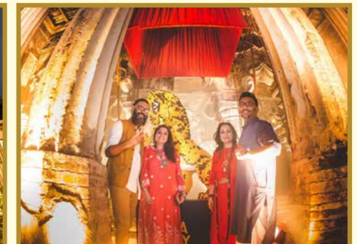
The first exposition of India Story