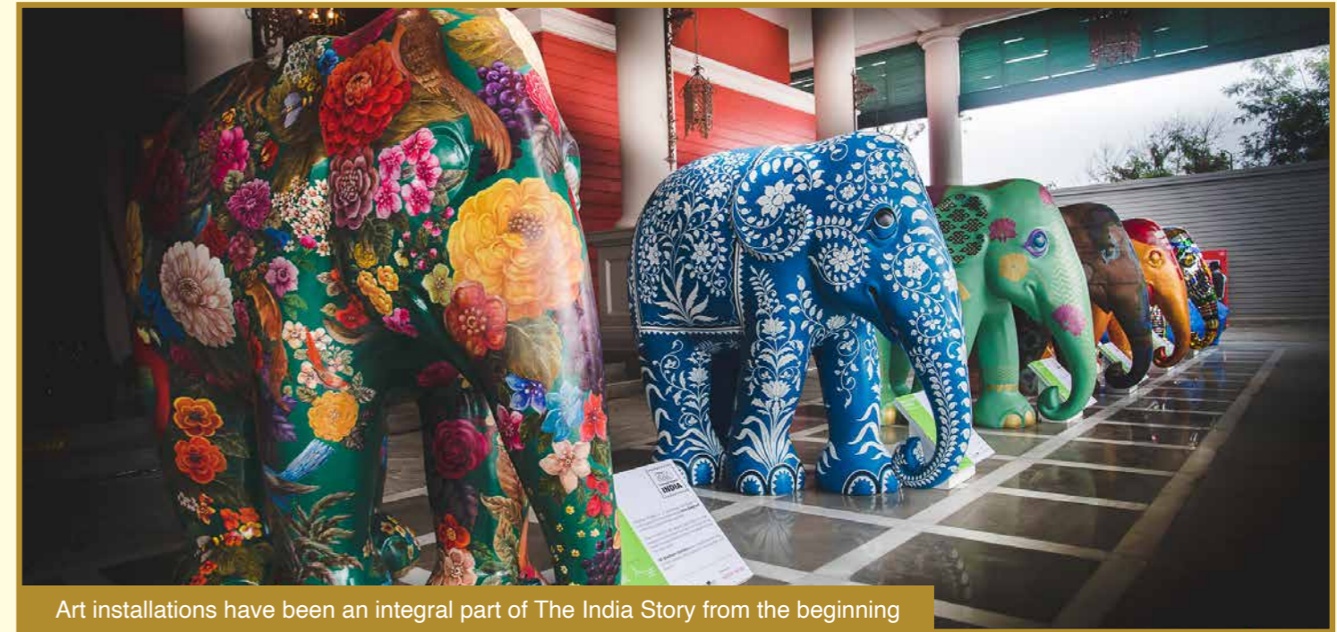
Art installations have been an integral part of The India Story from the beginning