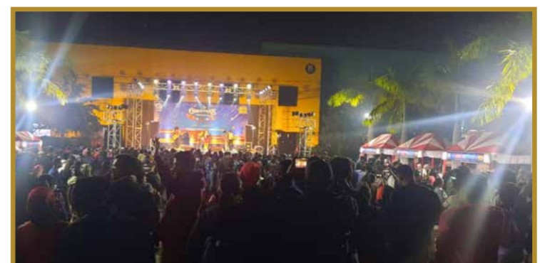
Food, music and lots of fun made it a memorable Christmas at City Centre Haldia.