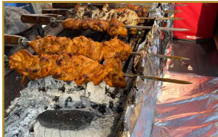
Food lovers were in for a Mughlai treat as Ecospace Business Park recently witnessed Biryani & Kebab Festival on the premises, where some of the most popular eateries put together a lip-smacking menu.