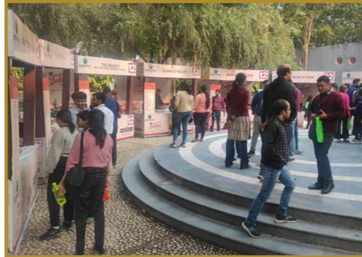
Visitors were in for a pleasant and delicious surprise recently at City Centres, Salt Lake and New Town, as well as at Ecospace Business Park where more than 15 bakery destinations from across the city came together with their baked goodies on the occasion of a three-day Bakery Festival.