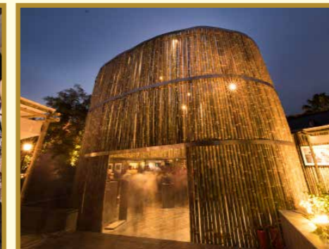
Swabhumi gets transformed into an art wonderland