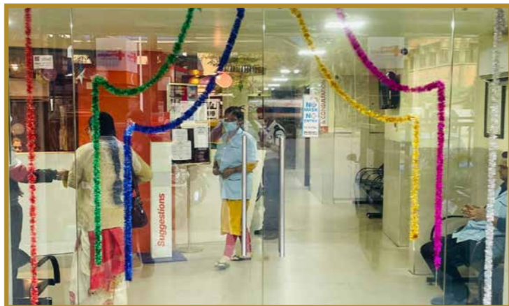
Christmas celebrations brought in lots of cheer and happiness at the Neotia Mediplus facility in Mahamayatala, Garia.