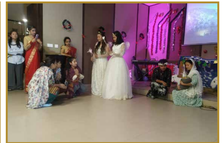
Pre-Christmas Celebration 2022 ushered in great joy at Neotia Getwel Multispecialty Hospital, Siliguri. Participants from various departments regaled the in-house audience with songs, dance, and plays.