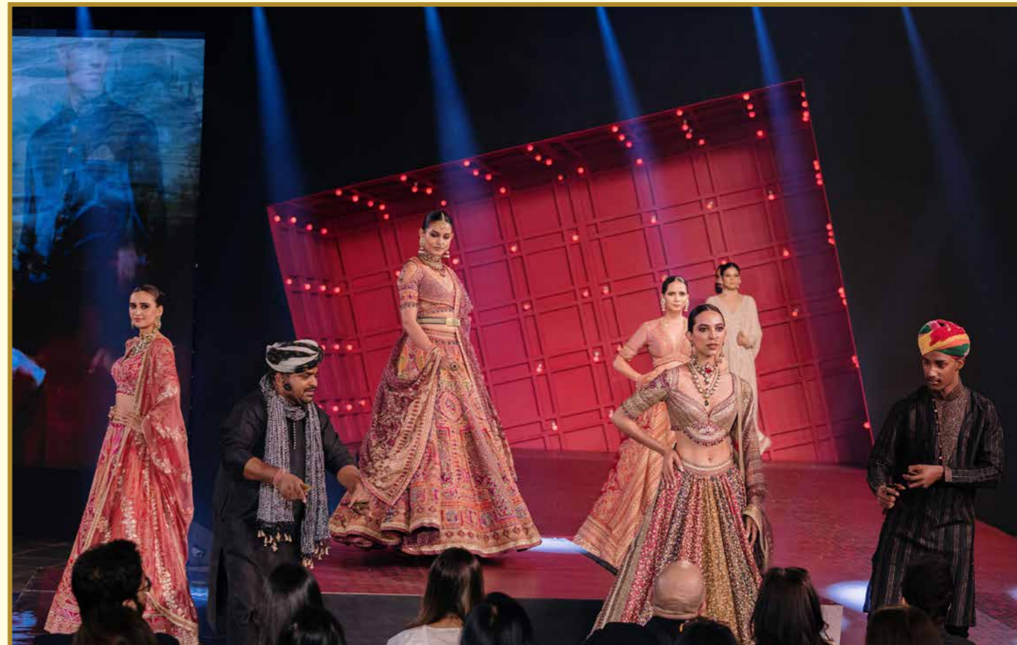
Spectacular, path-breaking and aesthetic - the hallmarks of The India Story

Calcutta is obviously always going to be my passion and pet. But eventually maybe one day I would like to take TIS out of Calcutta. Calcutta will always be special. The support I get from this city, it's unparalleled. Finding a space like Swabhumi is next to impossible. So doing TIS in any other city would be a huge challenge for me. Where? I don't know. When? I don't know. Of course, I will continue doing India Story in Calcutta, but I may do it in another city one day. Let's see when and where it happens.