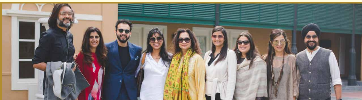
The success of The India Story depends on a fabulous team work

From the beginning to this date, I have been very fortunate to have some of the most talented and brightest minds coming and adding different innovative dimensions to The India Story.