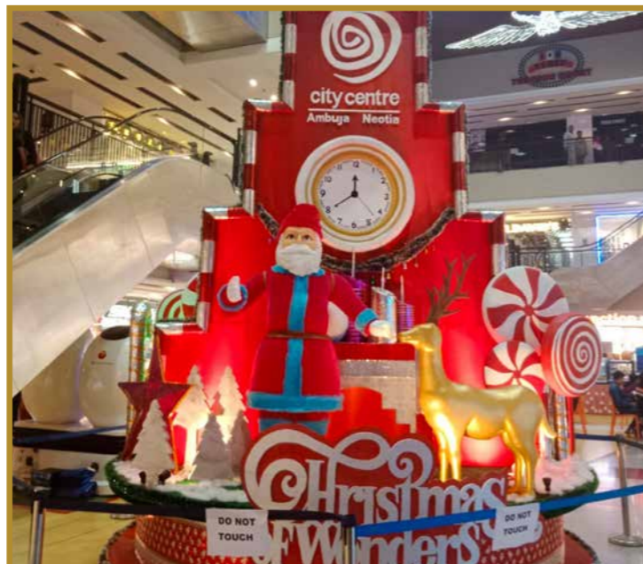
From an ice-roofed Santa House to lit-up angels and fairies, the décor at City Centre Siliguri ensured visitors had a gala time celebrating the season.