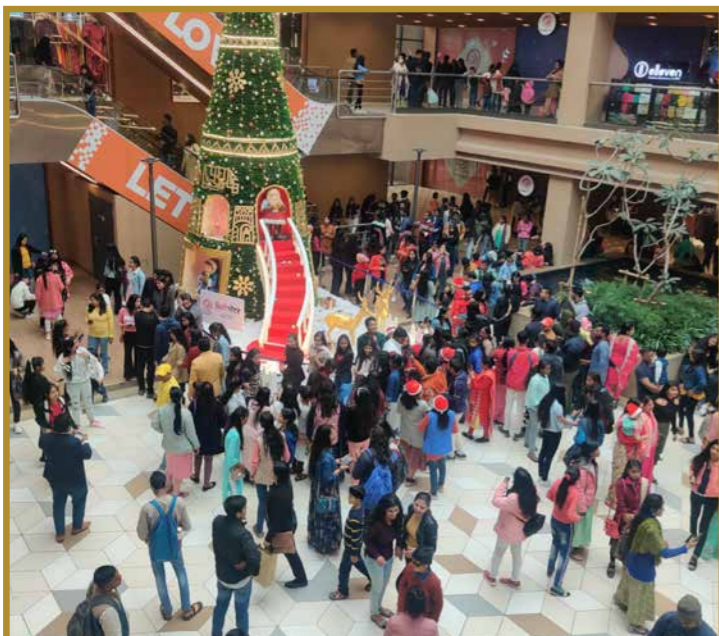
City Centre Patna decked up in festive frills to usher in Christmas.