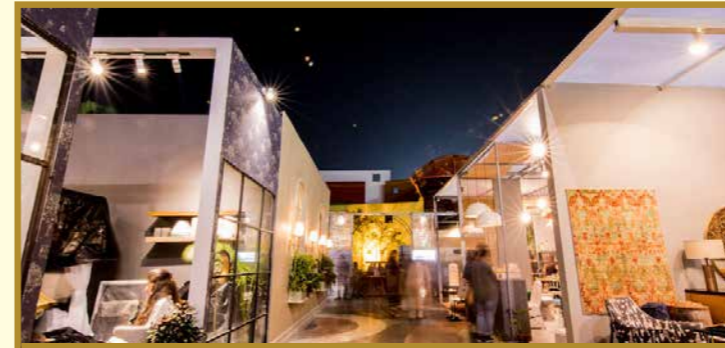
The Home Edit has been an instant hit