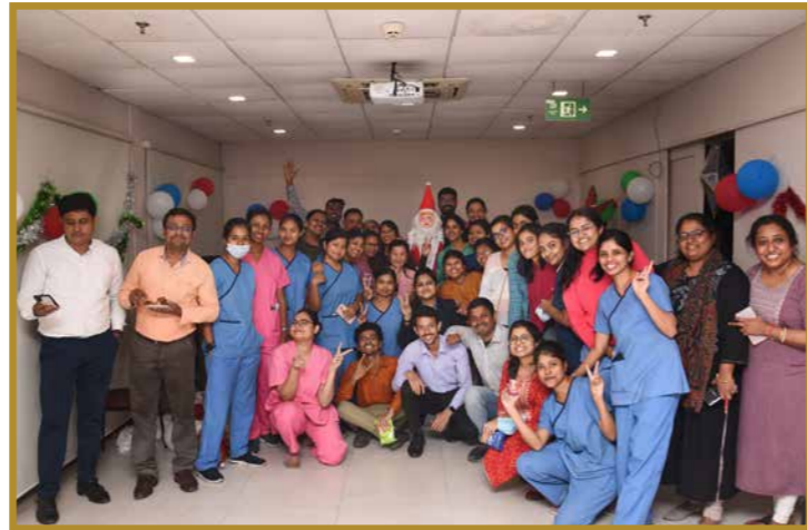
Christmas celebrations at Neotia Bhagirathi Woman and Child Care Centre, Rawdon Street and New Town.