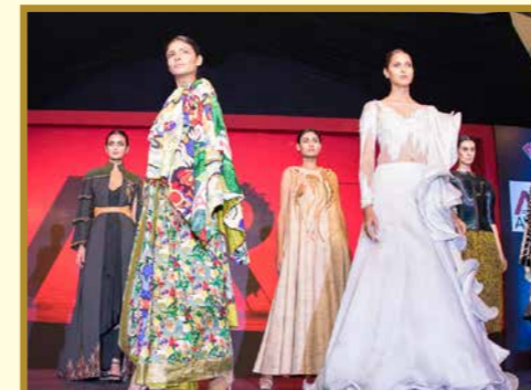
Fashion shows draw a loud applause each time

Over the years, it has evolved into a must-visit family occasion, where men, women and children come together, attracted to the stories of Indian art, craft, design and culture.