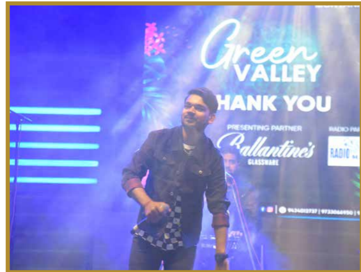
Members of Montana Vista welcomed the New Year with Green Valley, a special musical event to celebrate the season.