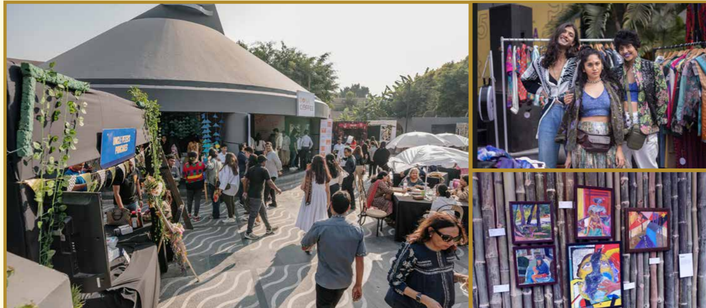
From cool art & crafts to trendy fashion, exhibits at The India Story attract the young as well as the young at heart