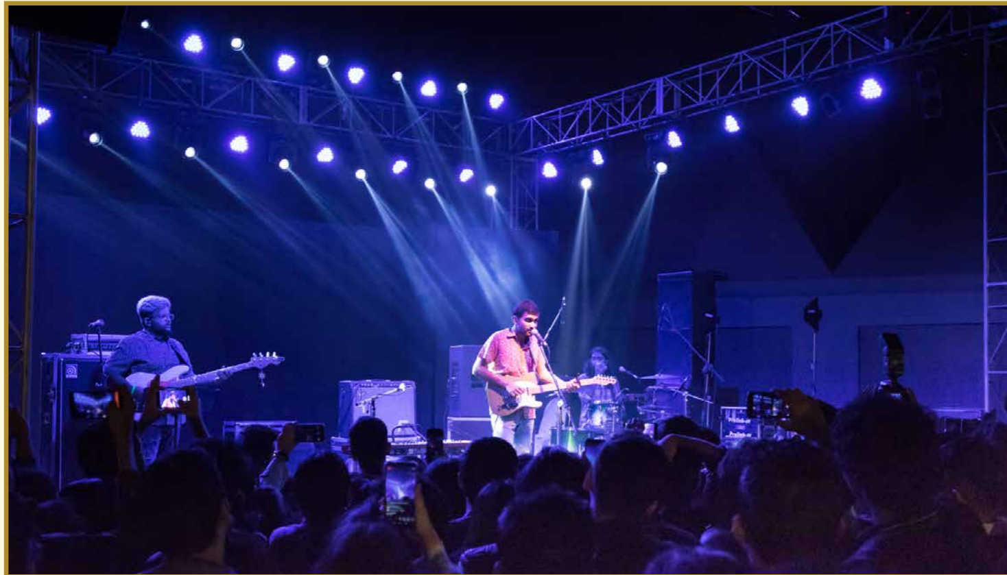
Live music is a huge draw for people of all ages. Prateek Kuhad at a live performance in Swabhumi