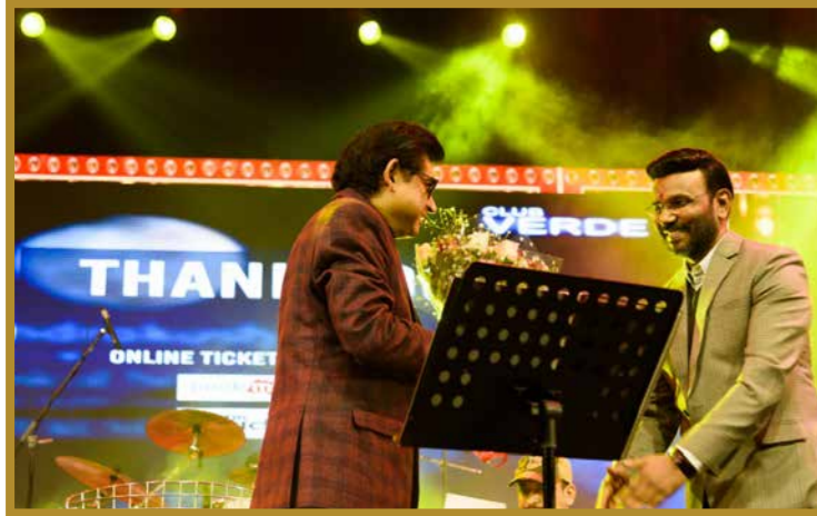
Chandrakosh - a Musical Soiree at Club Verde featuring Amit Kumar had an overwhelming response from the members and their guests.