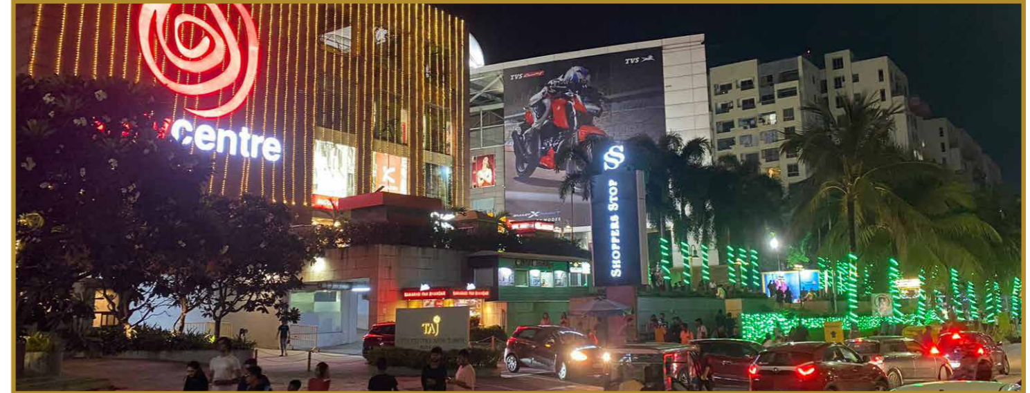
Christmas celebrations at City Centre New Town got a boost with beautiful décor and dazzling fairy lights.