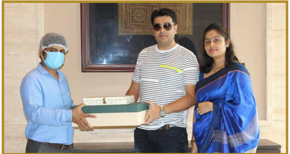
Gifts galore for this family who will soon reside in Utalika