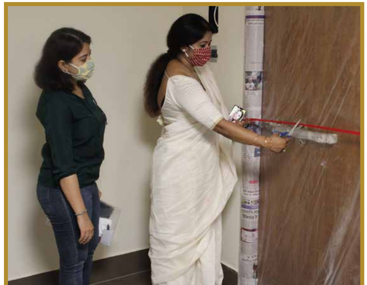
A ribbon away from happiness!