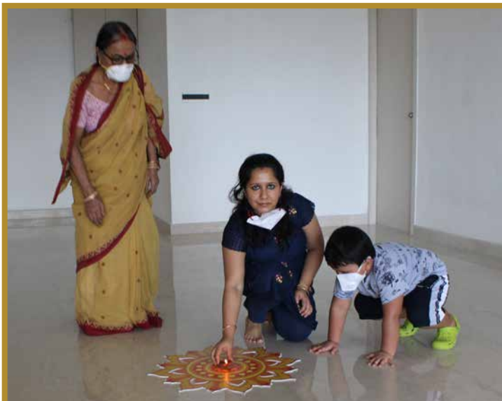
Lighting the lamp of Hope for a blissful future