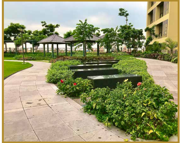
Another glimpse of Utalika flourishing in the rainy season