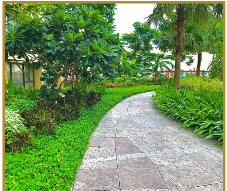
Walk down this path without an umbrella to feel raindrops falling on your head!