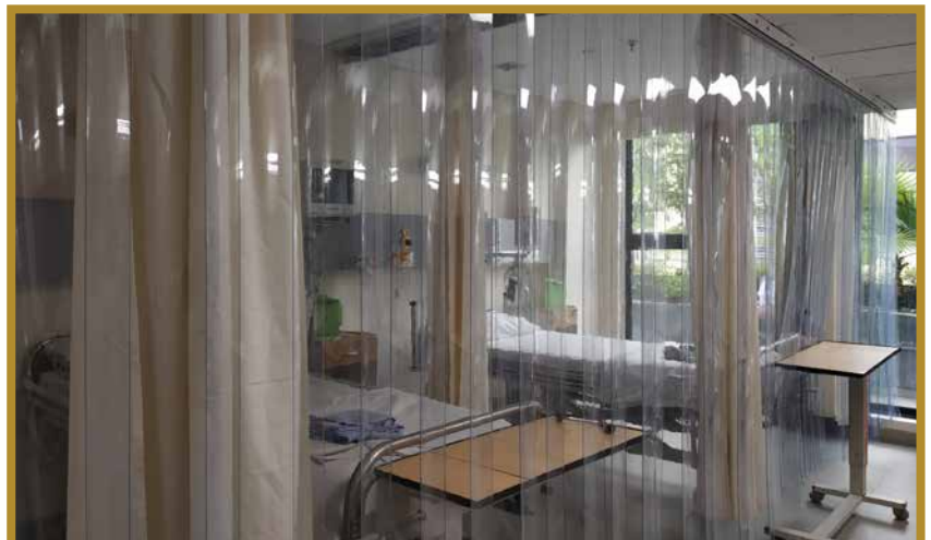
A glimpse of the Isolation Bed at the COVID Ward