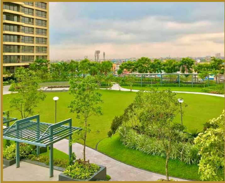
Utalika, surrounded by a carpet of green grass during the monsoon