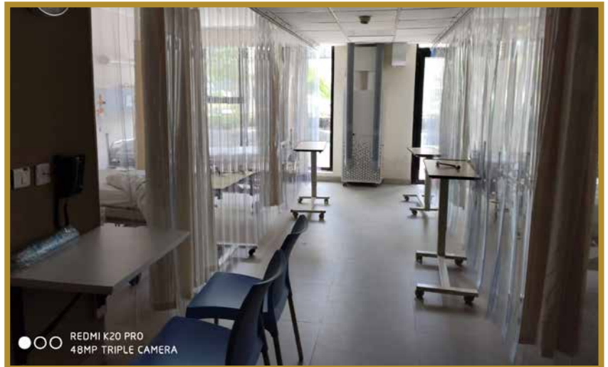
A view of the COVID Ward at NGHCC, Siliguri

In addition, there are enhanced safety measures for patients, rigorous maintenance of infection control protocol, and protective gear meant to be worn by consultants, clinical associates and hospital staff. Frequent sanitization and disinfection of our premises and screening of patients at every point, along with restricted visitors in the hospital, are some other measures the Neotia Getwel Health Care Centre has undertaken to ensure maximum safety.