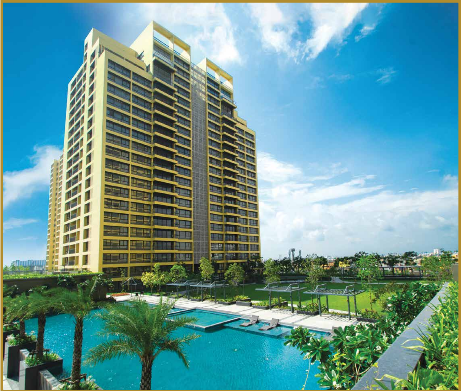
What a view! A glorious tower at Utalika overlooking the swimming pool