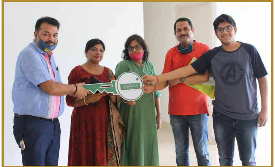
A symbolic key being handed over to a happy resident

Flats at Utalika Luxury phases I & II, launched at the latter half of 2016, was handed over to its residents on time earlier this month. The project comprises spacious apartments close to the buzz and charm of South Kolkata in a new-age address, offering exclusive 4-storey residents' club, two natural lakes and an array of other bonus features in familiar surroundings blessed by nature's bounty. Here are glimpses of some of the happy residents to whom the keys to their kingdom were handed over this month.