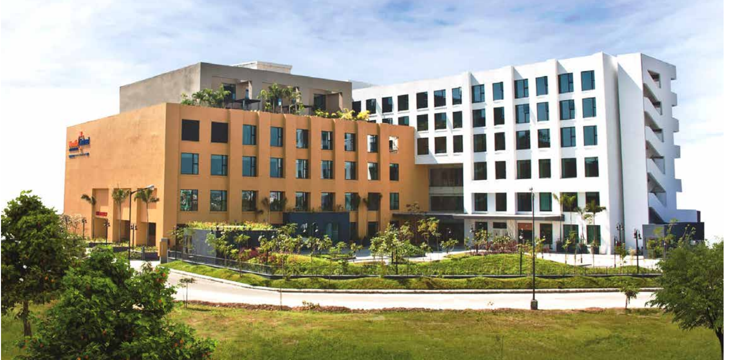
Neotia Getwel Healthcare Centre at Siliguri

N eotia Getwel Health Care Centre at Siliguri now admits Covid patients with safety measures to prevent cross-contamination of non-Covid patients. There is a separate floor for COVID -19 suspected and positive patients. All ISHRAE COVID 19 guidelines for air conditioning and ventilation are being followed. Also in use are medical grade air purifiers with three stage filtration consisting UVGI technology and H14 grade HEPA filters. there are negative air pressure points, with 12 air changes per hour in the room. And, of course, there are designated entry and exit points.