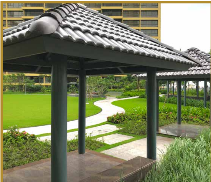
Just the spot to sit and watch the rain fall on fecund grass and flowering beds

'My heart dances today!/ O it dances like the peacock!/ It dances! It dances!/ Exuberant like the peacock's tail/ Spread out in splendid hues!/ My fervent heart gazes at the sky/ Laden with mad exuberance/ Who is there all alone/ Singing in lazy abandon on the Bakul branch?/ Bakul flowers drop from the tree/ As her sari's loose end flutters in the breeze/ And her wind-blown hair covers her eyes.../ Then, suddenly, her chignon tumbles free!/ The rain pelts down on emerald twigs,/ The groves quiver with the chirping of crickets,/ And the river overflows its banks near my village!/ My heart dances today! O it dances like the peacock...'